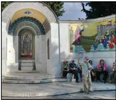
Altar of Saint Paul at Berea

Paul stopped at Rhodes while returning to Jerusalem at the end of his third missionary journey. Acts 21:1. One tradition says that Paul's ship landed in a harbor at Lindos on Rhodes. (B, L, D)