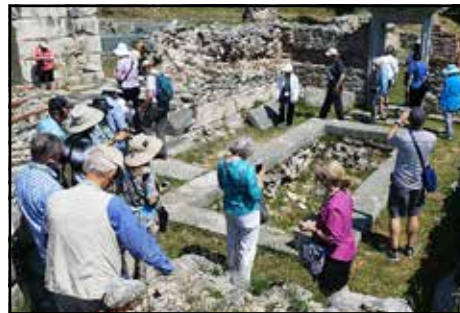
Baptistry in Ancient Philippi

In the afternoon, we visit ancient Ephesus . As we walk down Curetes Way, we see a marvelous restoration of an ancient city — State Agora, Odeon, Temple of Hadrian, Trajan Fountain, Library of Celsus, Commercial Agora , and the Grand Theatre where the people cried, "Great is Diana of the Ephesians." (B, L, D)